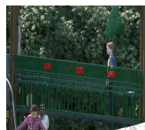
Play Rails $5,000