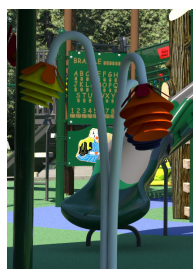
Flower Chimes $5,000