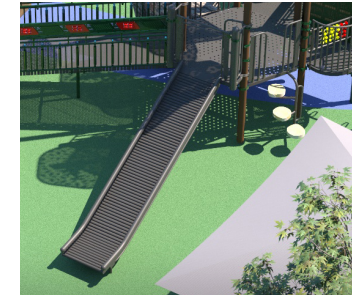
Slide 5-12 Section $18,000