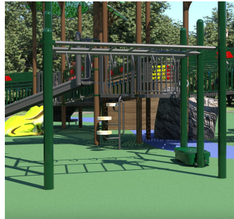
Monkey Bars $15,000