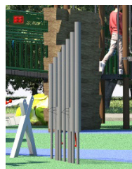
Musical Chimes $1,500