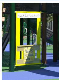
Alex's Lemonade Stand $10,000