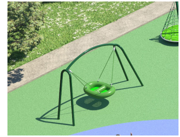
Disc Swing $45,000

Your generous support will enable children and caregivers of ALL abilities the opportunity to experience the joys and benefits of play. This destination playground will truly impact ten thousand people each year.