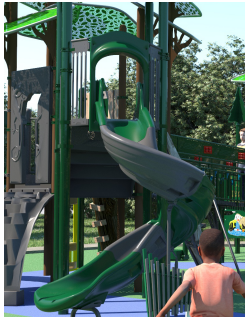
Slide 2-5 Section $15,000