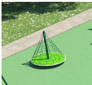
Zoom Twist $15,000