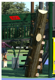
Log Climber $5,000