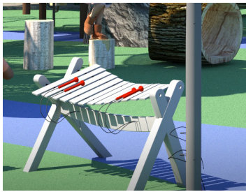
Musical Xylophone $18,000