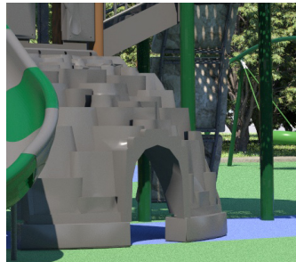
Tikes Peak $12,000