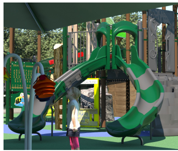
Double Quantum Slide $18,000