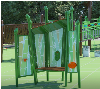
Quiet Grove $10,000