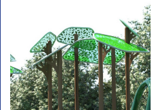
Leaf Shade $5,000