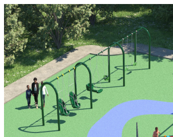
Swing Set $15,000