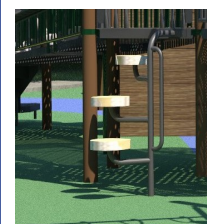
Log Slice Climber $5,000